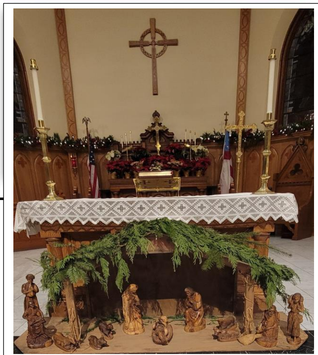
The Altar was beautiful On Christmas