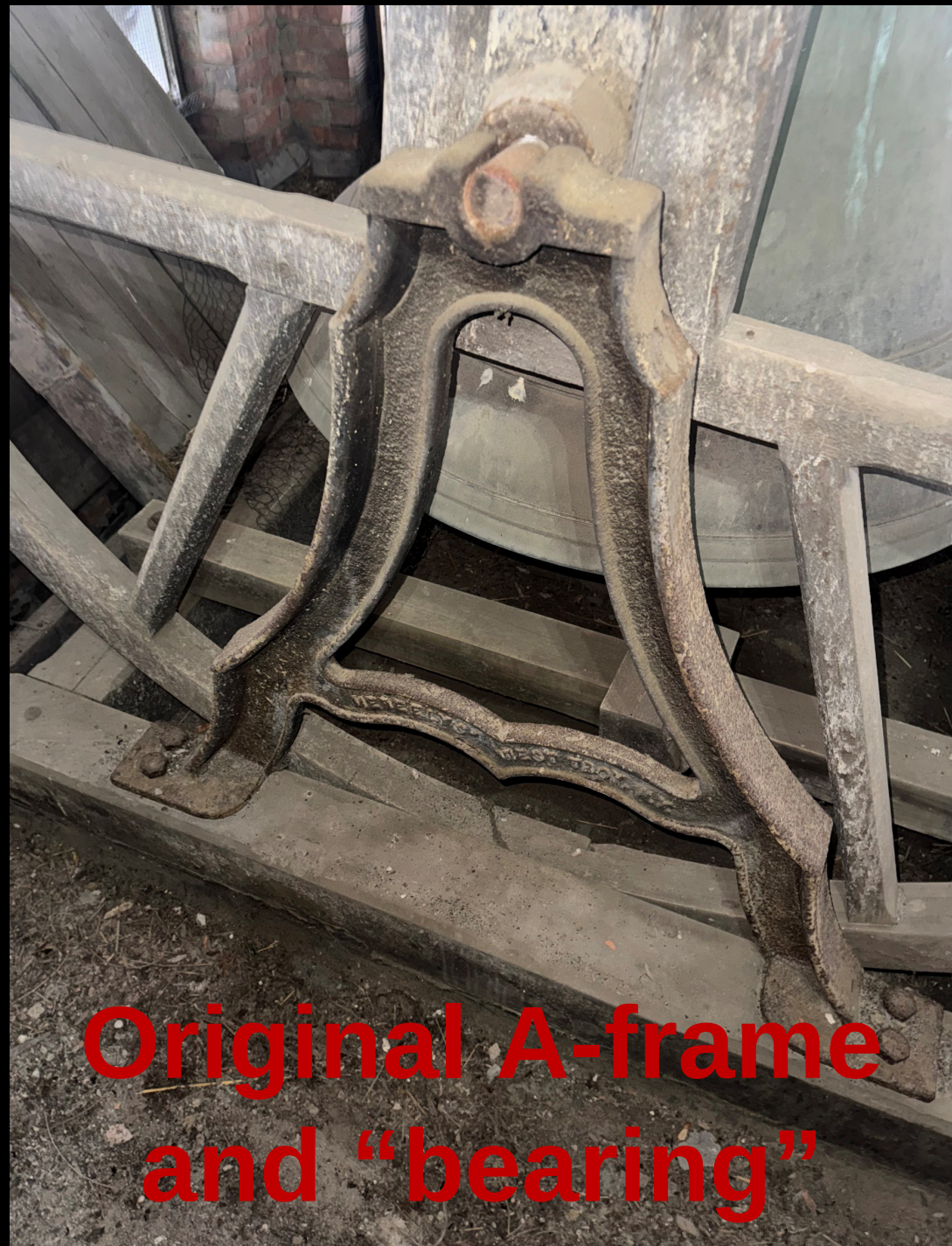
Original A-frame and "bearing"