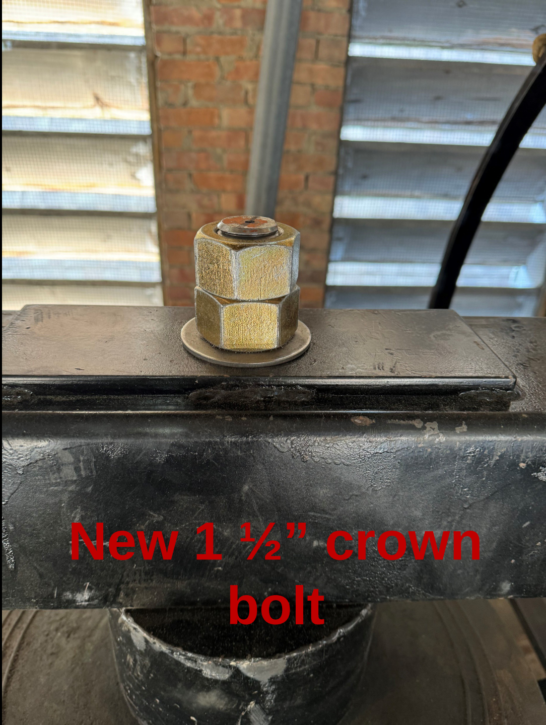
New 1 1/2" crown bolt