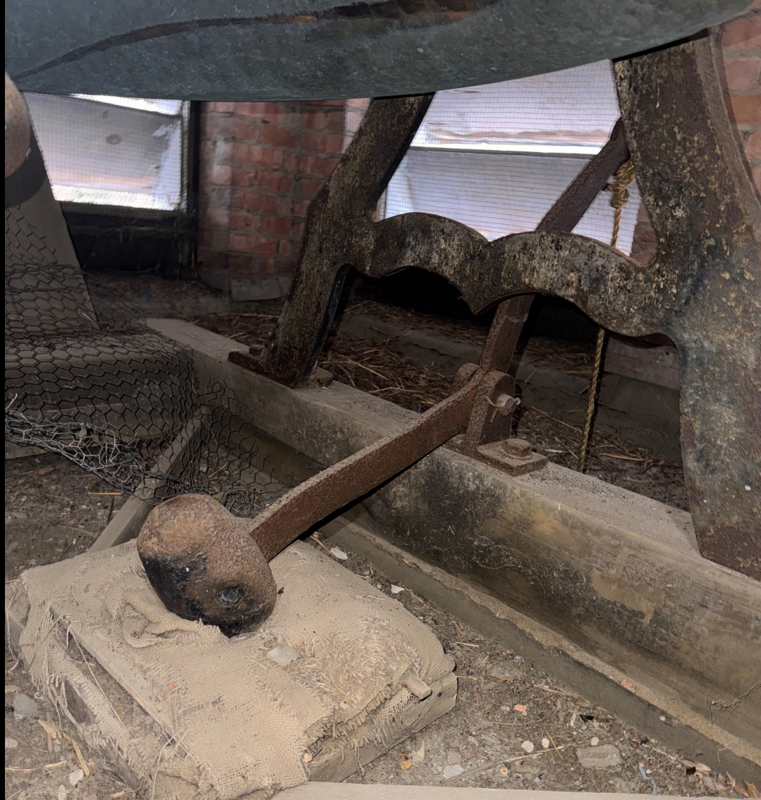
The original Tolling Hammer, complete with 1895 horsehair pillow...