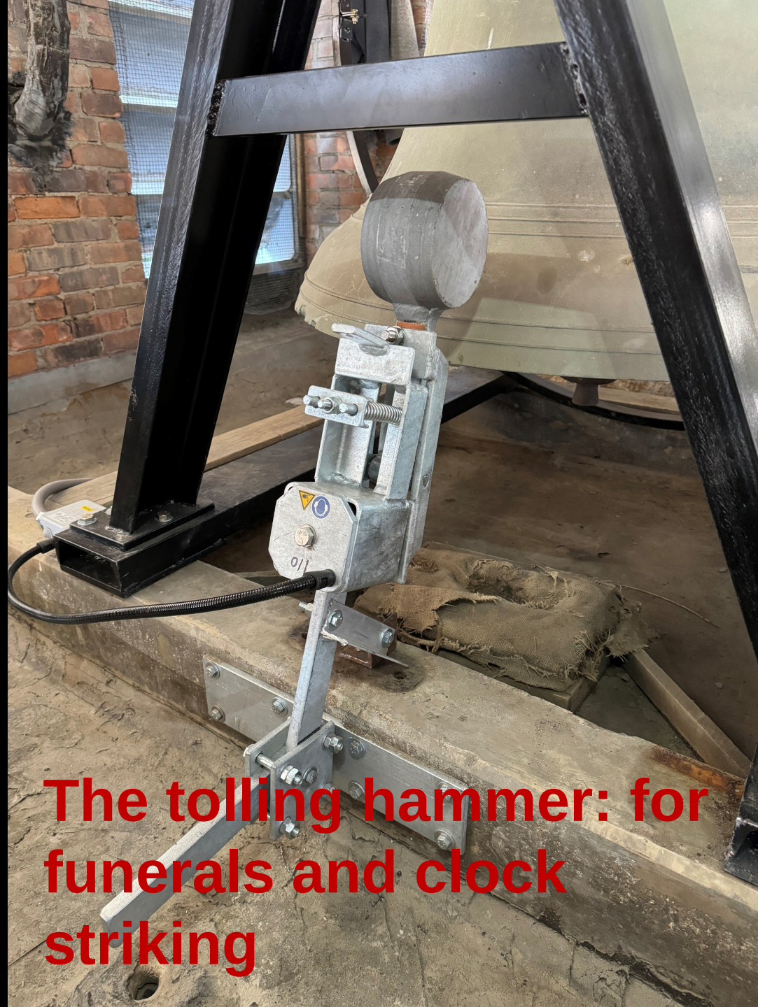
The tolling hammer: for funerals and clock striking